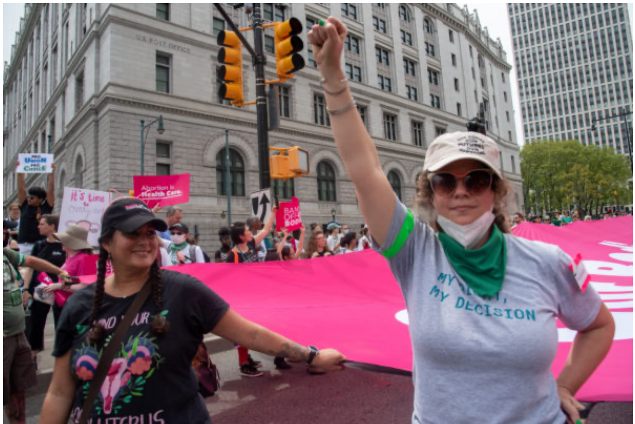
Planned Parenthood of Greater NY had a 100-foot banner!