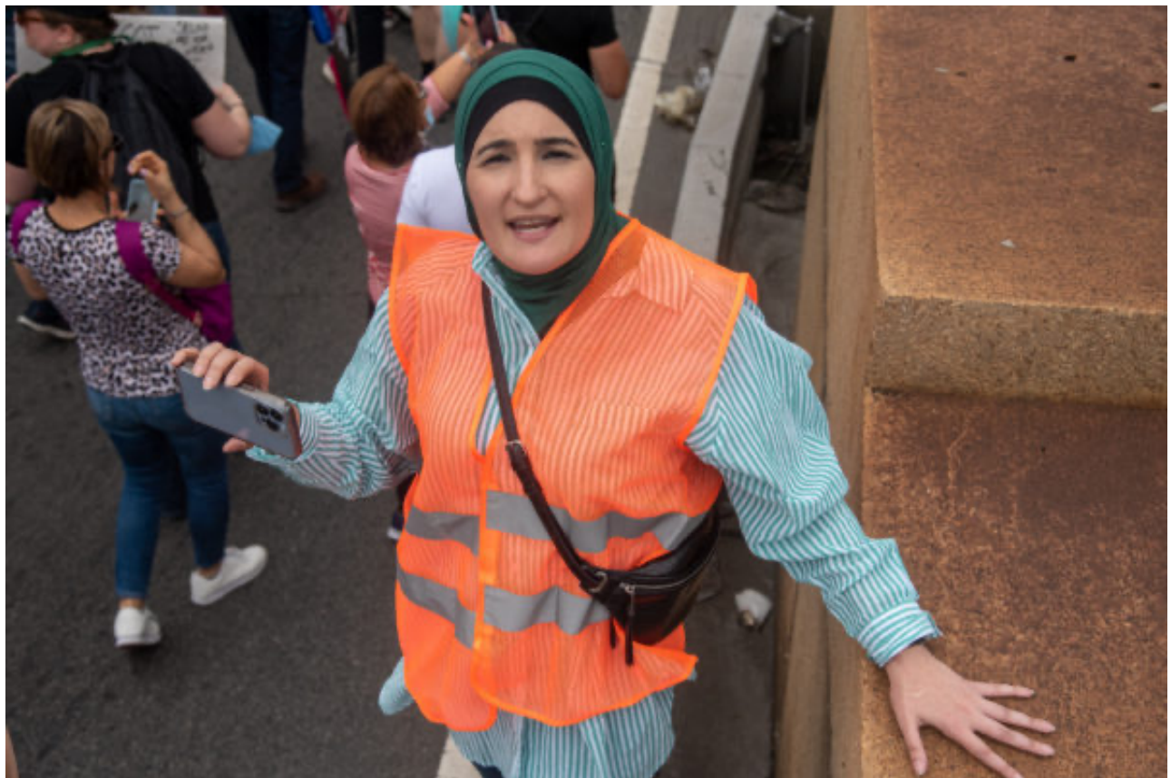
Linda Sarsour (Portrait): Activist and founder of the 2017 Women's March, Linda Sarsour was born and