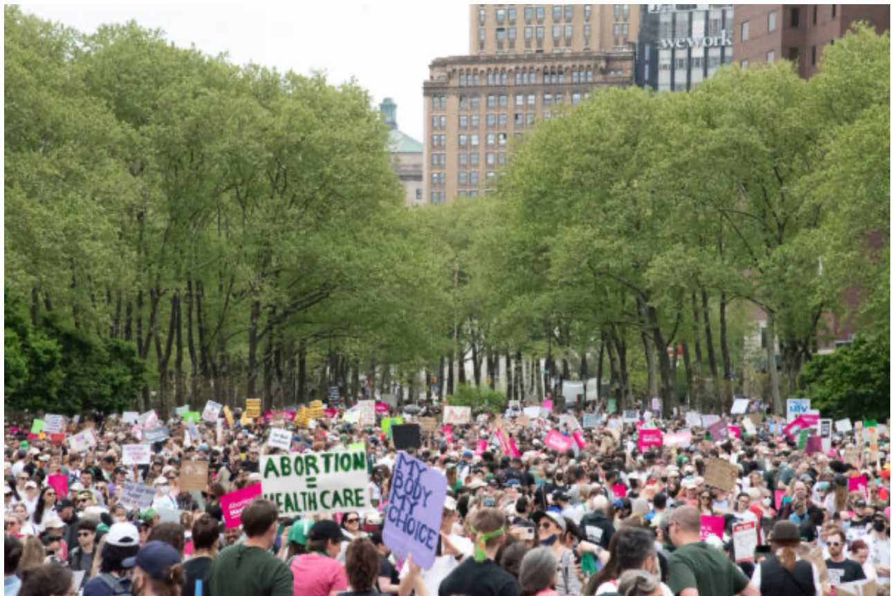
Crowd shot of Cadman Park Lawn looking south. The masses eagerly awaited the opportunity to march over the Brooklyn Bridge.