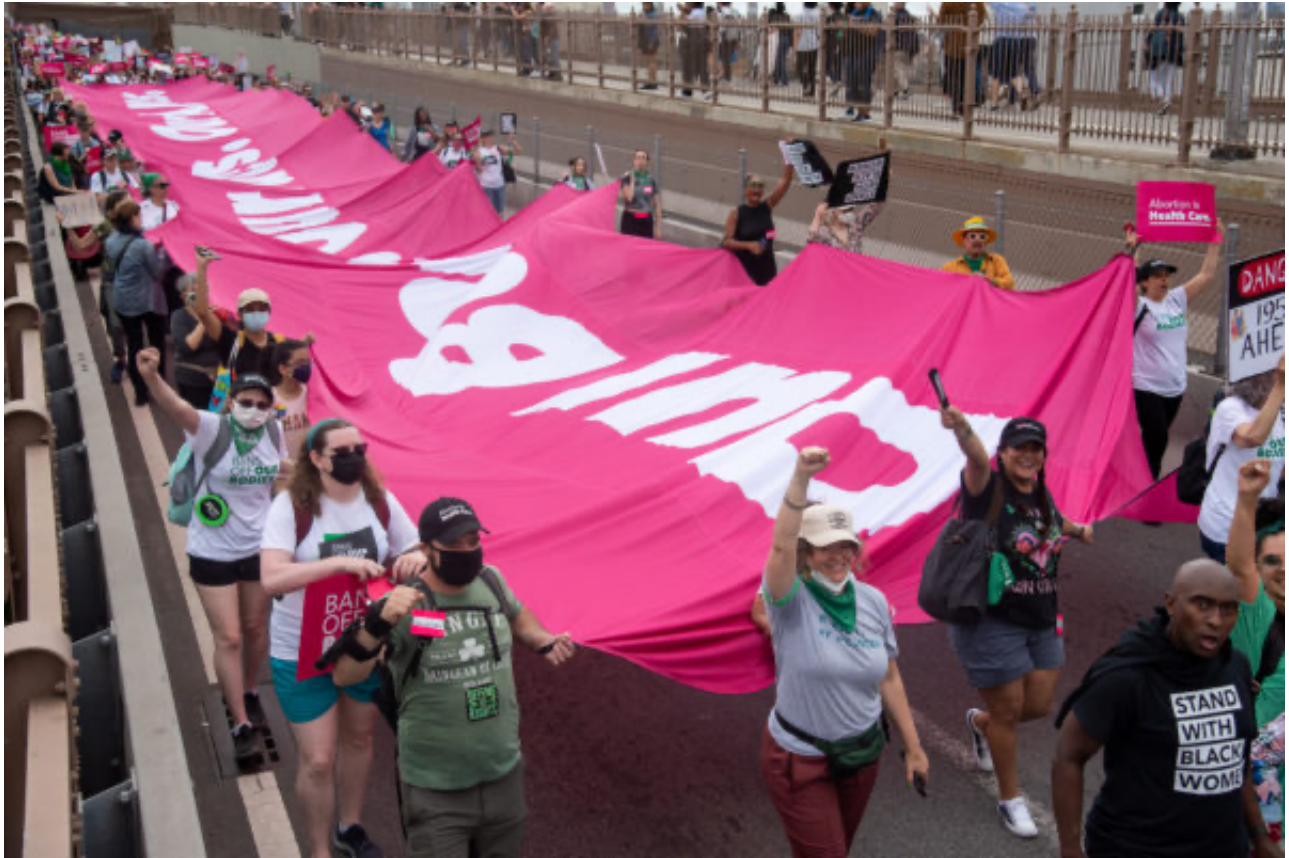
Planned Parenthood and their 100 foot banner make their way across the Brooklyn Bridge.

was LOUD and PROUD about a woman's right to choose safe, legal abortions. While she was recently priced out of Brooklyn, she cannot wait to move back and still runs her business in our beloved borough.